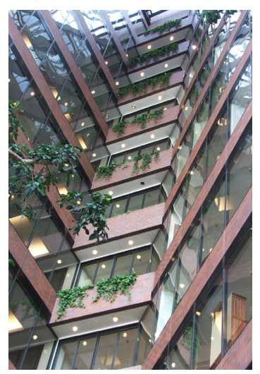
This office building features a patented exterior tile panel system for its curtain wall and a sculpture that reflects segments of the light spectrum on sunny days.