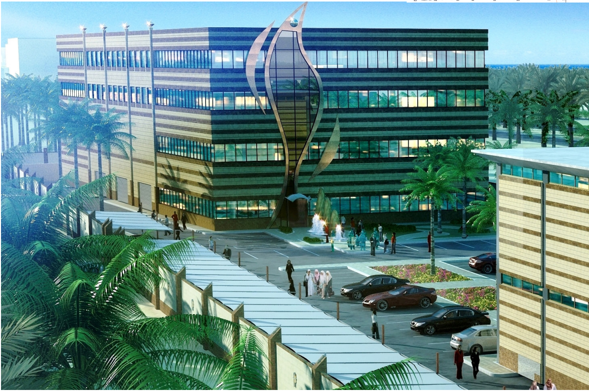
View of the Office block and entry plaza