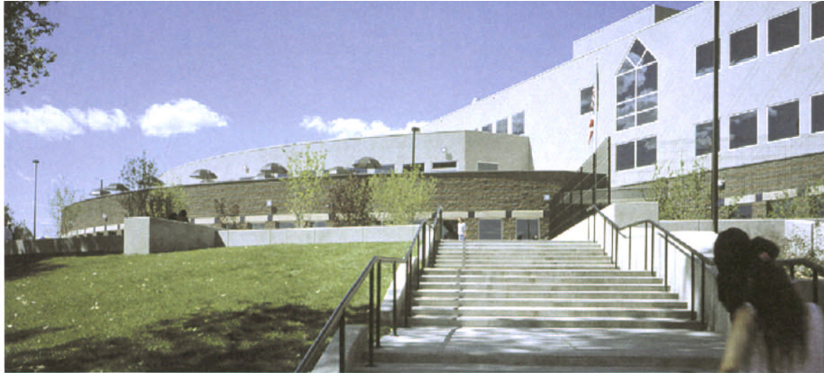
This city government building was designed to meet the needs of its approximately 1,100 employees and the community.