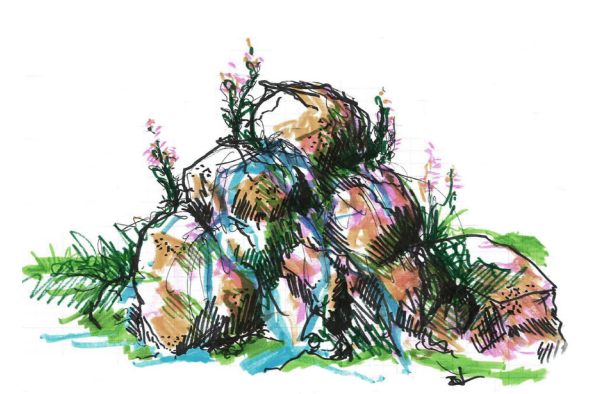
"Wildflower Spring" early concept sketch.

Owner: CAI Investments Use: Hotel, Multi-familiy Residential, General Office, Retail Area: 650,000 sf Services Provided: Architecture, Interior Design, Visualizations Completion Date: Est. 2023