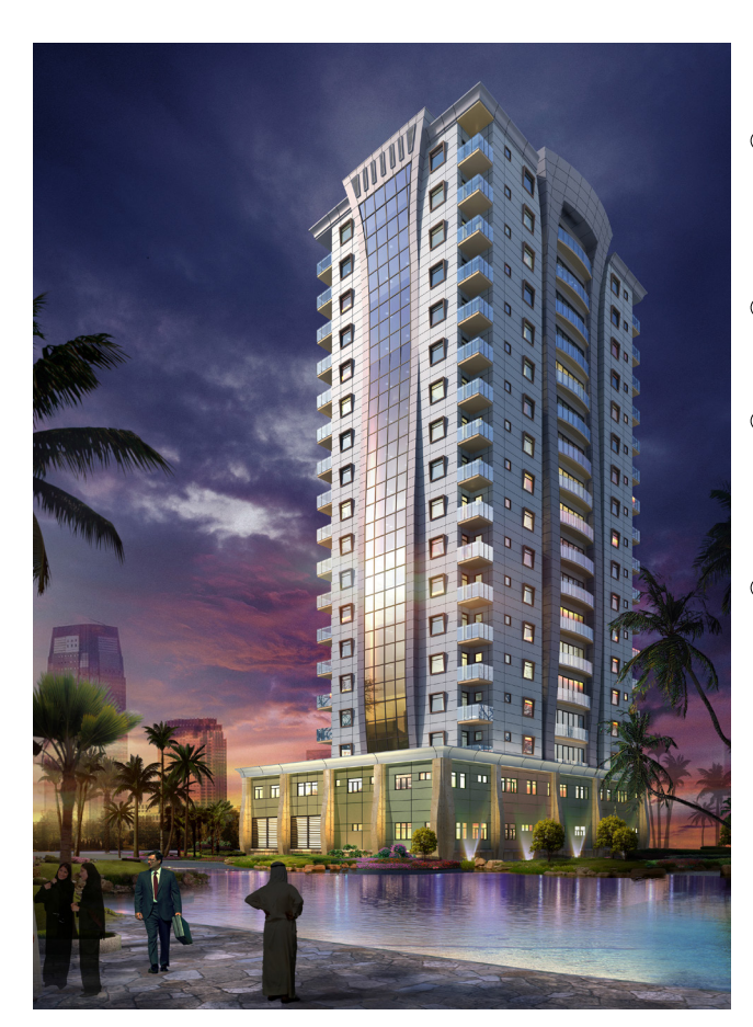
The King Plam tower is designed with a Middle Eastern sensitivity to rhythm and pattern.