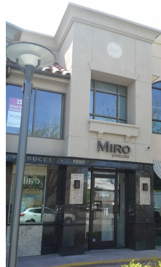
Main Entry off Detroit Street

Services Provided: Architecture, Interior Design, Display and Casework design