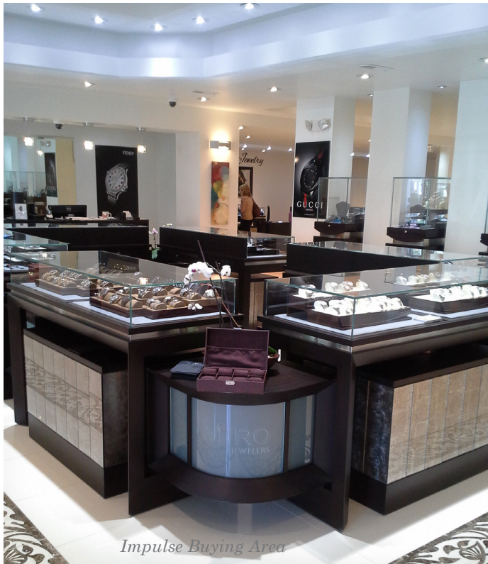
Impulse Buying Area

OS was commissioned to provide tenant packages and building facelift (core-and-shell upgrades) for this 3-story building in Cherry Creek North-Denver's upscale shopping district.