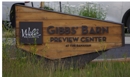
Mining inspired Signage and Pool