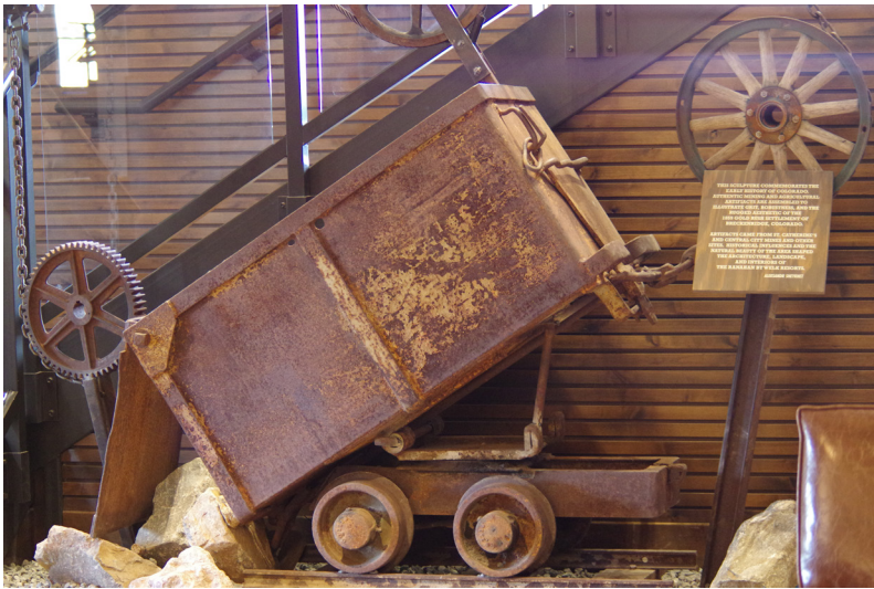
Historical Mining Inspired Display in Lobby