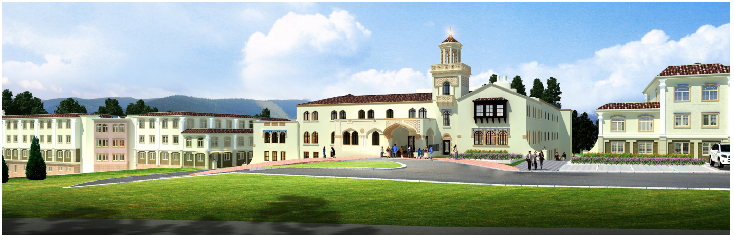
Exterior of existing building (Centered) with two new proposed wings to the east and west.

Services Provided: Site Planning, Architecture, & Interior Design