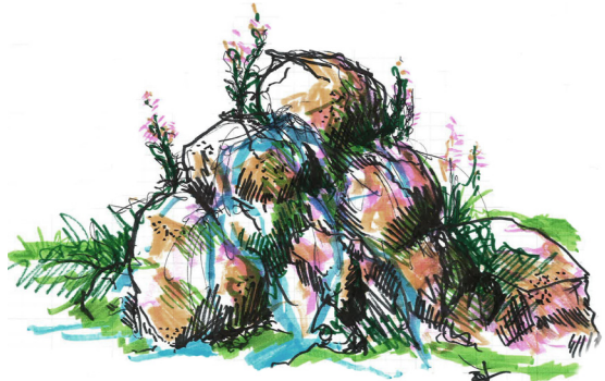
"Wildflower Spring" early concept sketch.

Owner: CAI Investments Use: Hotel, Multi-family Residential, General Office, Retail Area: 650,000 sf Services Provided: Architecture, Interior Design, Visualizations Completion Date: Est. 2023