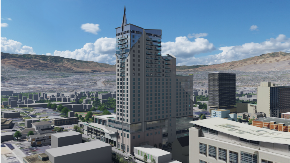
Wingfield Tower is exceptionally sited across from the Truckee River and Wingfield Park in downtown Reno, Nevada.

Wingfield Tower Mixed-Use Development is located on the Truckee River in downtown Reno just across from Wingfield Park. It is rare to find such an incredible site for an urban project of this scale. As such, the design is composed to follow the sloping landscape to the river, respond to the vibrant pedestrian experience, and maximize the magnificent mountain and downtown views surrounding the project.