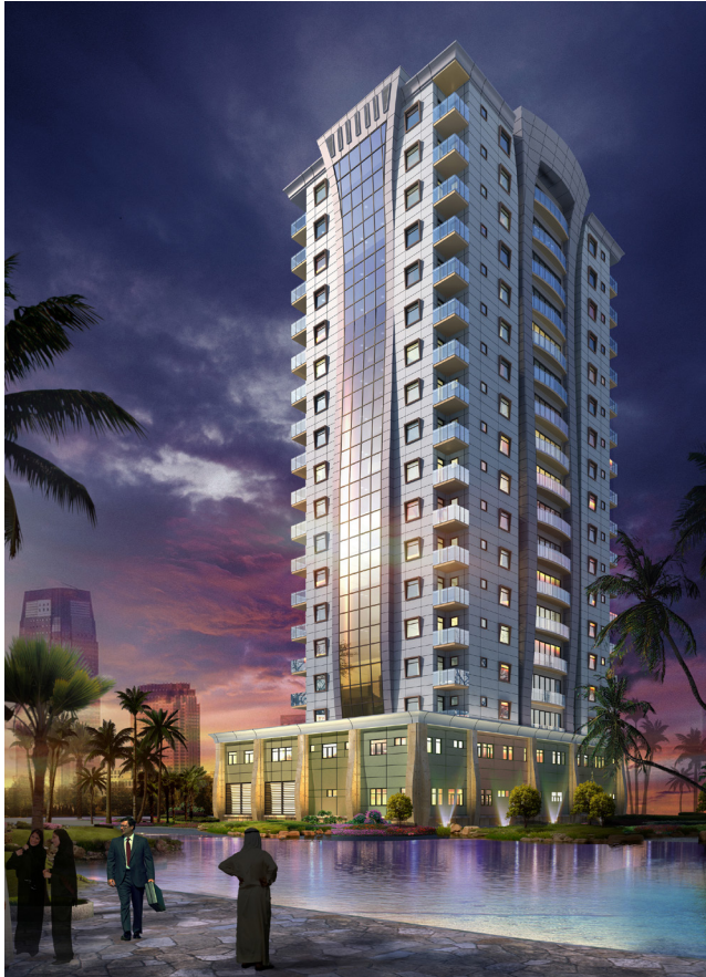
The King Palm tower is designed with a Middle Eastern sensitivity to rhythm and pattern.